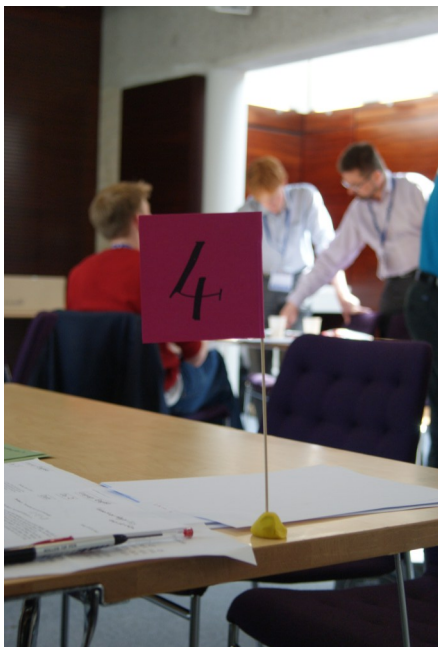
Coordination winding down