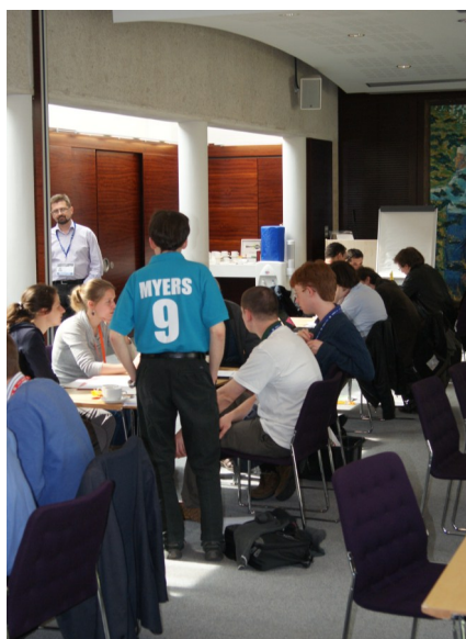
Coordination in full swing

As a recent IMO contestant, how did you find being on the 'other side': Not as much fun!